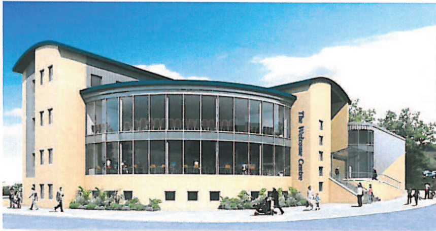
The Welcome Centre - Coventry

The session following lunch will contain case studies that offer the opportunity to learn from other people's successes and mistakes.